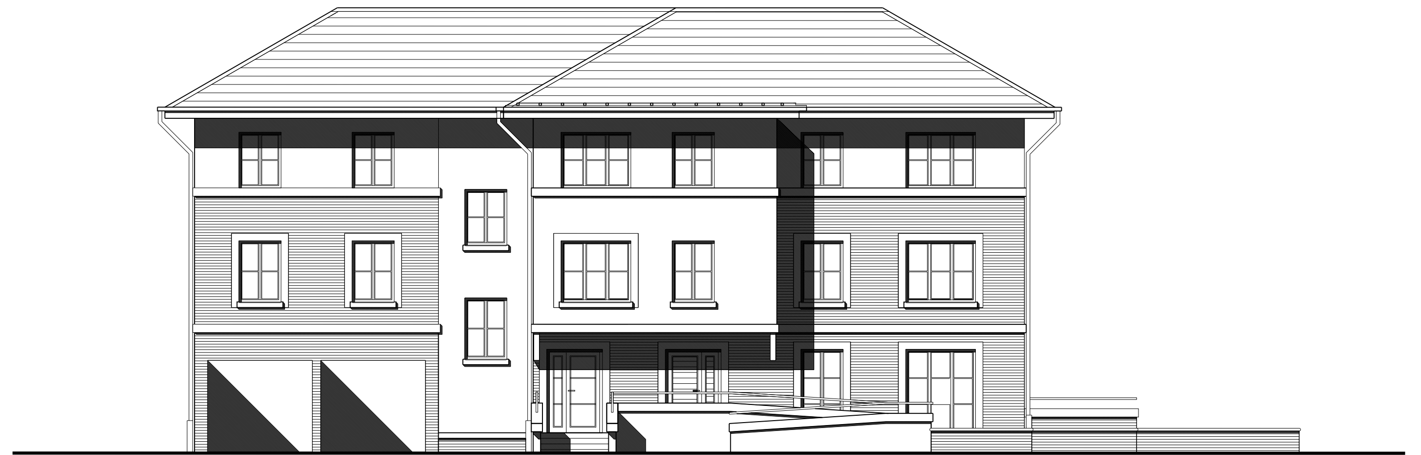
BLOCK G SOUTH ELEVATION